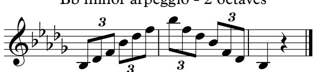
*** Bb minor arpeggio - 2 octaves