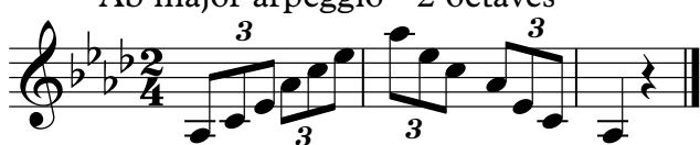
Ab major arpeggio - 2 octaves