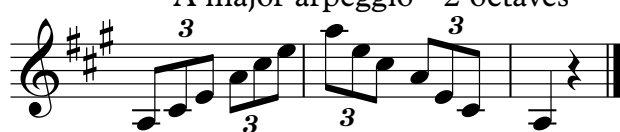
*** A major arpeggio - 2 octaves