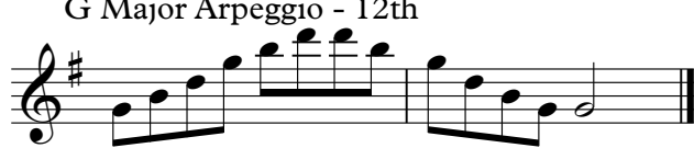
G Major Arpeggio - 12th