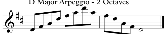
D Major Arpeggio - 2 Octaves