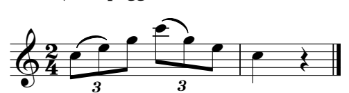
C major arpeggio